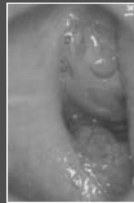
The removal of enlarged tonsils like this can relieve airway obstruction.

We only take them out if they are doing more harm than good. We take tonsils out if they cause recurrent sore throats despite treatment with antibiotics. The other main reason for removing tonsils is if they are large and block the airway. A quinsy is an abscess that develops alongside the tonsil, as a result of tonsil infection, and is most unpleasant. People who have had a quinsy therefore often choose to have a tonsillectomy to prevent having another. Tonsils are also removed if we suspect there is a tumour in the tonsil. A rapid increase in the size of a tonsil or ulceration or bleeding occurs if a tumour of the tonsil develops. Tumours of the tonsil are rare.