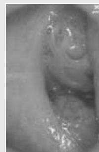
The removal of enlarged tonsils like this can relieve the airway.

Antibiotics may help for a while, but frequent doses of antibiotics can cause other problems. A low-dose antibiotic for a number of months may help to keep the infections away during an important period such as during examinations. There is no evidence that alternative treatments such as homeopathy or cranial osteopathy are helpful for tonsil problems.